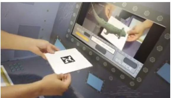
Figure 1. Participants rotate a small piece of vinyl and see the a 4D projection of the "living" image of the reptile on the screen

In the Interactive Submarine, there is a new species of reptile being studied in a lake. Participants start by seeing a movie in the right part of the module where they are trained about the goal of the game, and the statistical concepts being learned. Then, they have to capture as many specimens as they can, using a joystick in the left part of the module, in order to analyze the main characteristics of the reptiles. A balance, a ruler and a camera are ready to measure weight, age, size and sex in the laboratory at the right part of the module. A 4D (augmented reality) device is installed in the module so that participants can rotate a small piece of vinyl and see the image of the reptile "alive" on the screen (see Fig. 1 and 2).