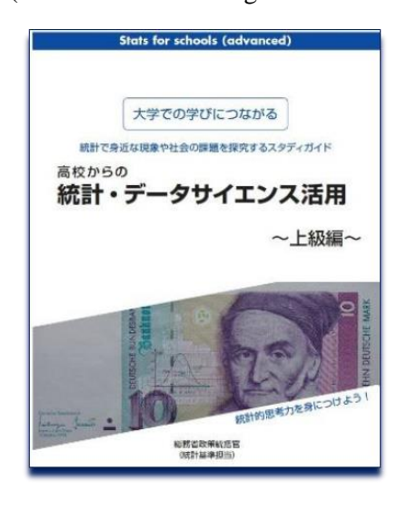
Figure 2. Advance level Teaching Materials (Left: Textbook for high school students, Right: Instructional book for teachers)

when actually conducting surveys, it is noted out that sampling must be designed so that there is no bias in gender, age, etc. that may affect the survey results. In addition, methods to deal with data loss due to non-response etc., are also discussed. In other words, it is composed by very practical contents.